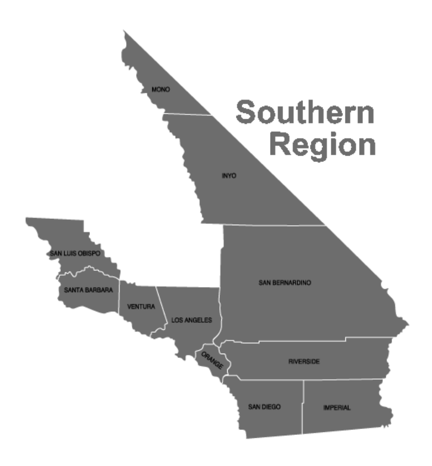
Figure B: REOC – Southern Region

The Southern Region REOC serves as a link to the SOC, communicating and coordinating any necessary resource requests to the state.