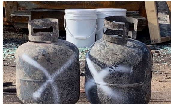
Empty containers EPA inspects will be marked with a white X, made safe, and left to be removed during Phase 2.