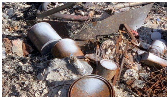
Examples of hazardous materials that will be removed.